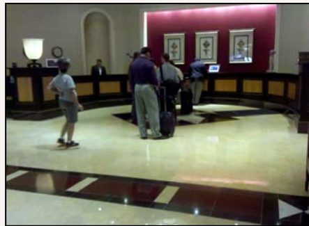
custom cabinetry & wood restoration