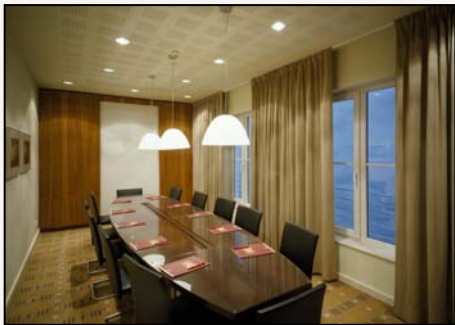
custom upholstery & window treatments

our goal - deliver supreme service, products, and workmanship at fair, competitive pricing.