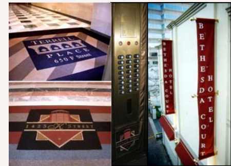
custom logo mats, elevator pads & flags